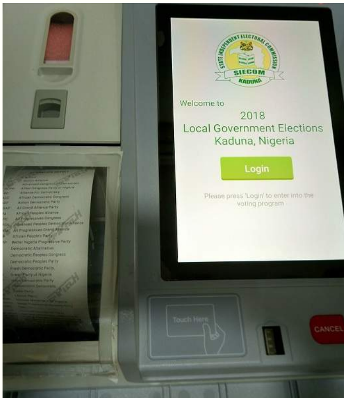
Above: Nigeria's first ever electronic voting exercise in Kaduna State

8. Electoral Offences: Section 124 of the Electoral Act, 2010 should be amended to impose stiffer sanctions for bribery and vote-buying. This imposes strict punishment such as a fine of 1million naira and imprisonment as long as 12 months for those who are found guilty of the above stated crime.