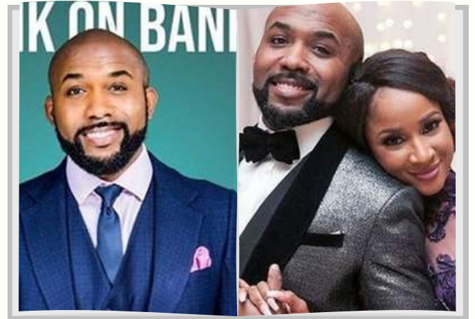
Banky Wellington (and wife right)

2. Grassroots efforts , while not always as appealing as engaging with the major political bodies (such as at FCT or high-ranking politicians or governmental bodies higher up in the hierarchy), it is a very important, if not the most important strategy to change the future of Nigeria. Rather than the top down approach, Nigeria will benefit most from the bottom up approach. We must focus on the people. Just as we in the diaspora are disenfranchised, those in Nigeria are equally and arguably more disenfranchised as they face the struggles of living in the country day to day. Their engagement and support is crucial.