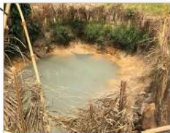
Community water source prior to our intervention