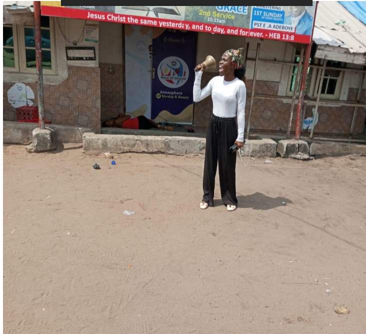
PVC Collection Evangelism in Epe by an ambassador