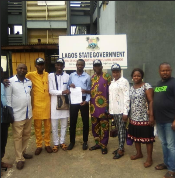
Meeting with Southern Youth Assembly of Nigeria