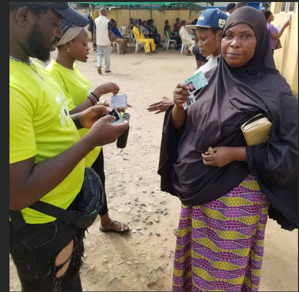
Ambassadors engaging a prospective voter