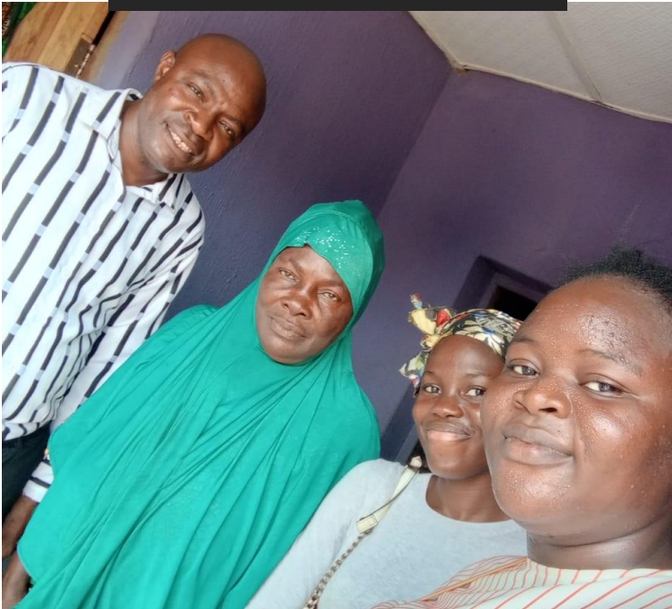
Meeting with Iya-Oloja of Akodo Community, Ibeju Lekki